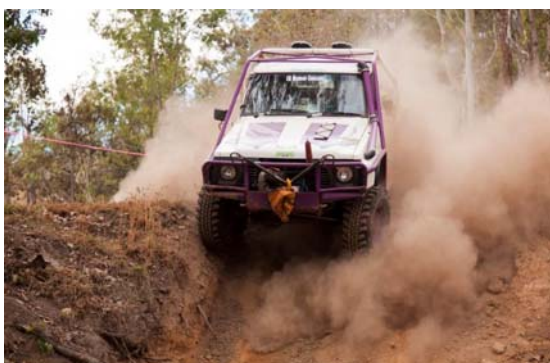
Wendy Coad "WTC"