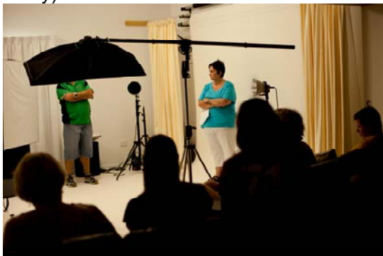
Lights! Camera! Action!